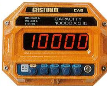
▲ Display & Keyboard